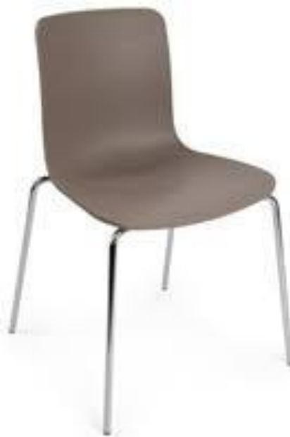
Sample 2. Iron tube with Plastic Top