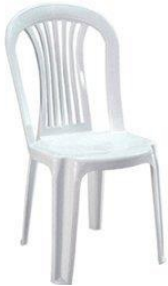
Sample 1. Plastic Chair